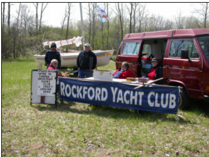
Spencer Park - Earth Day Celebration - the well hidden folks from RYC. To be fair, the high winds kept attendance low. Nice place to hang out though.

A Taste of Sail - coming up soon, June 14th. We'll try to get 'er done on one day. Need lots of boats and skippers.